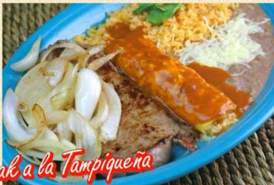
Steak a la Tampiqueña

Cooked to order consuming raw or undercooked meats, poultry, seafood, shellfish or eggs may increase your risk of food borne illness, especially if you have certain medical conditions