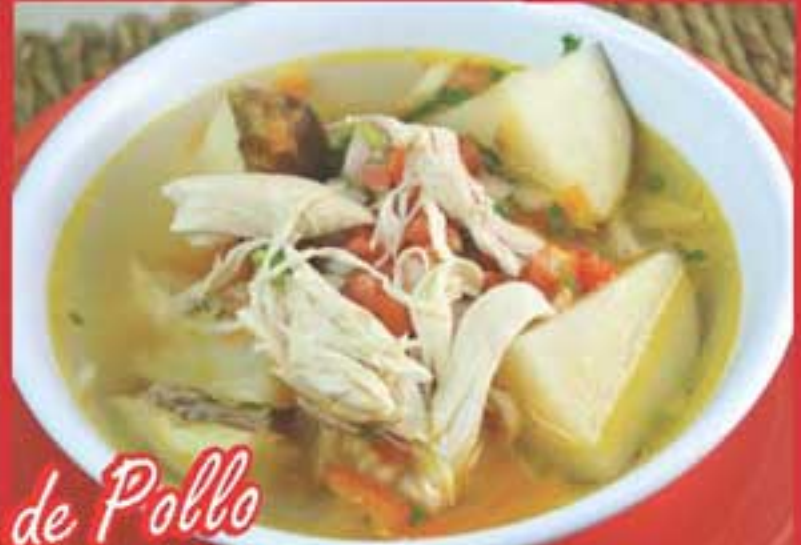
Sopa de Pollo