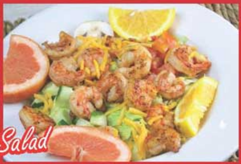
Poblanos Shrimp Salad