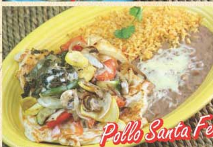
Pollo Santa Fe