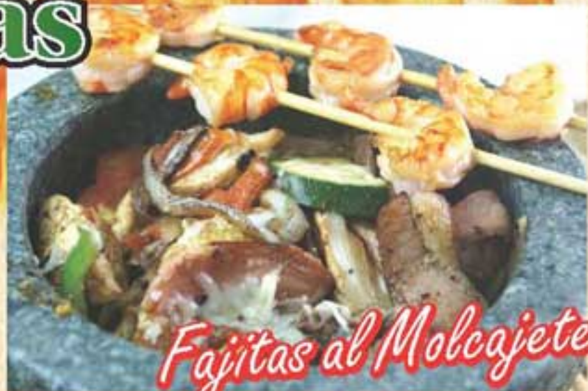
Fajitas al Molcajete