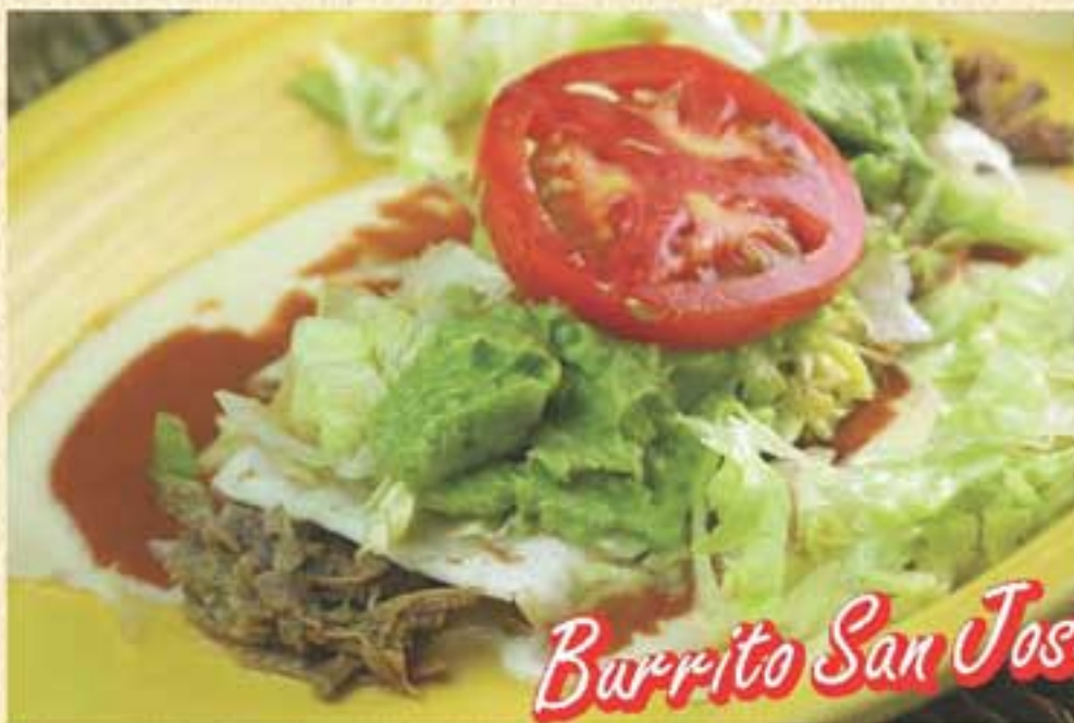
Burrito San Jose

A flour tortilla deep-fried, filled with beef or chicken. Served with beans, topped with nacho cheese, lettuce, tomato and guacamole 6.25