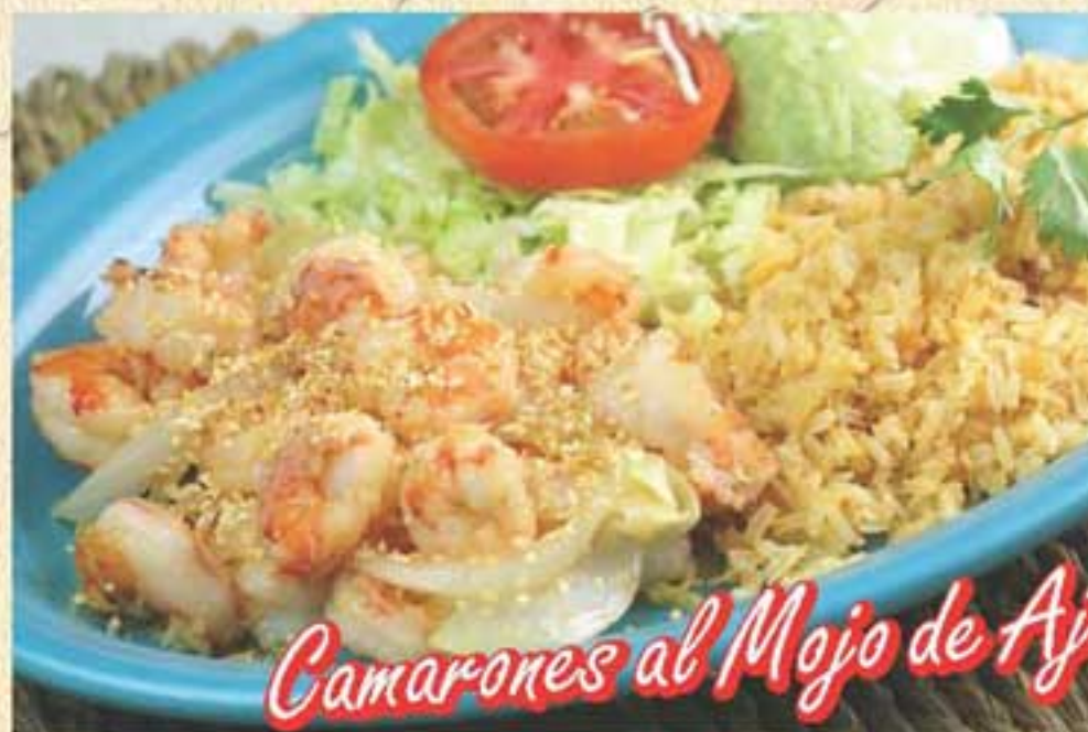
Camarones al Mojo de Ajo